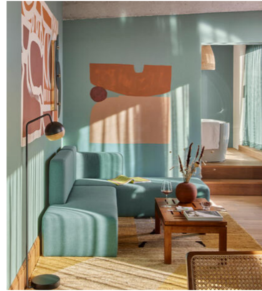
The stylish co-working space, left, and an airy penthouse suite.