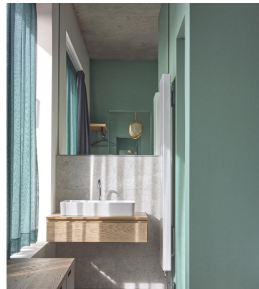
Rooftop terrace, left, and a bathroom.